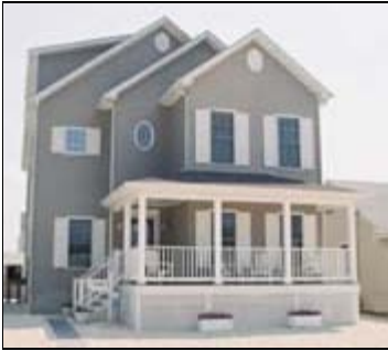
Approximately 3,200 sq. ft. — Three Story