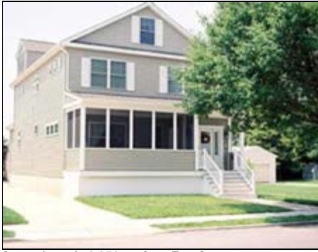
Approximately 2,350 sq. ft. — Two Story