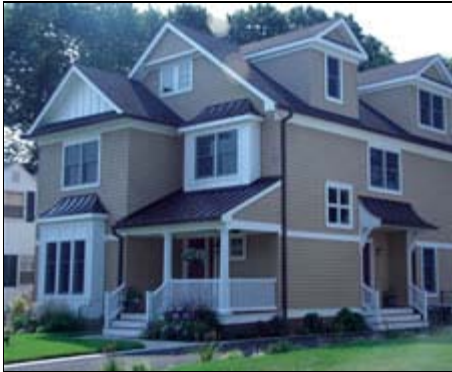
Approximately 2,760 sq. ft. — Two Story